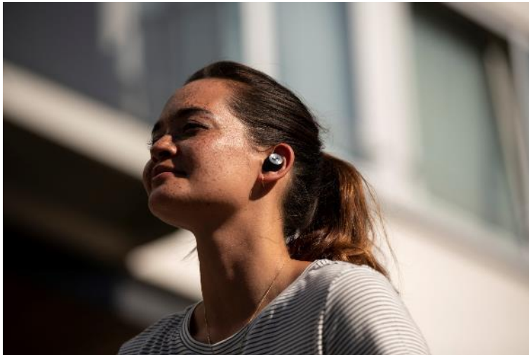
Sennheiser's MOMENTUM True Wireless earphones set new standards in true wireless audio.

Visitors to the Sennheiser booth can also get hands on with another exciting new product - the MOMENTUM True Wireless, which is making its CES debut.